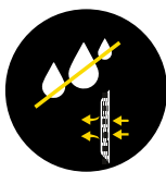
WATER RESISTANT & BREATHABLE