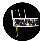
ELASTICATED HEM WITH SIDE ADJUST