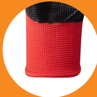
Elasticated Knitwrist for secure fit