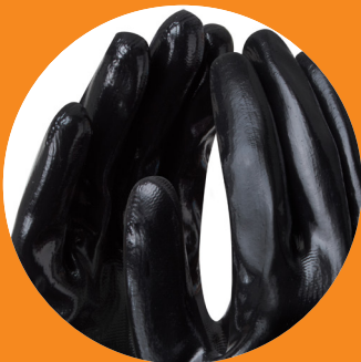
Full Nitrile Coating