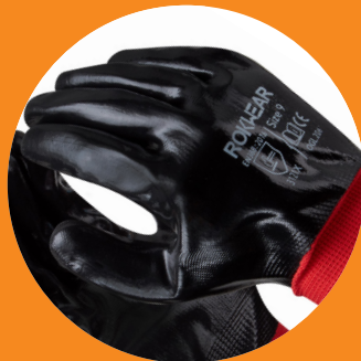
Lightweight for maximum dexterity