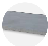
TBC/FBC 2' shelf SHE-CH2