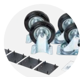
Castor kit CAS160-KS-FX-SB-CP