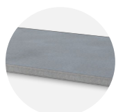
FSC3 shelf SHE-C3