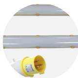
Lighting Kit FRLK-110