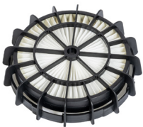
HEPA 13 FILTER