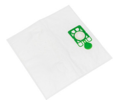
MICROFIBRE DUST BAGS