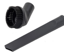
CREVIC TOOL & DUSTING BRUSH